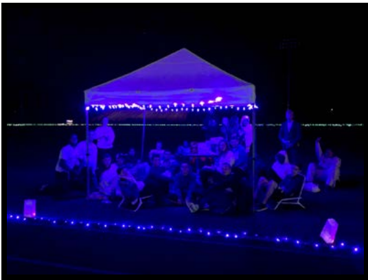
Before darkness fell, the running track at Battlefield HS was lit around its perimeter with light strings to mark the running route. Luminary bags with the names of twelve TACP members who've made the ultimate sacrifice also ringed the track. Cadets not running were able to take a break and warm up as temperatures dipped to near freezing.

flag as a safety precaution for roughly ten hours of darkness.