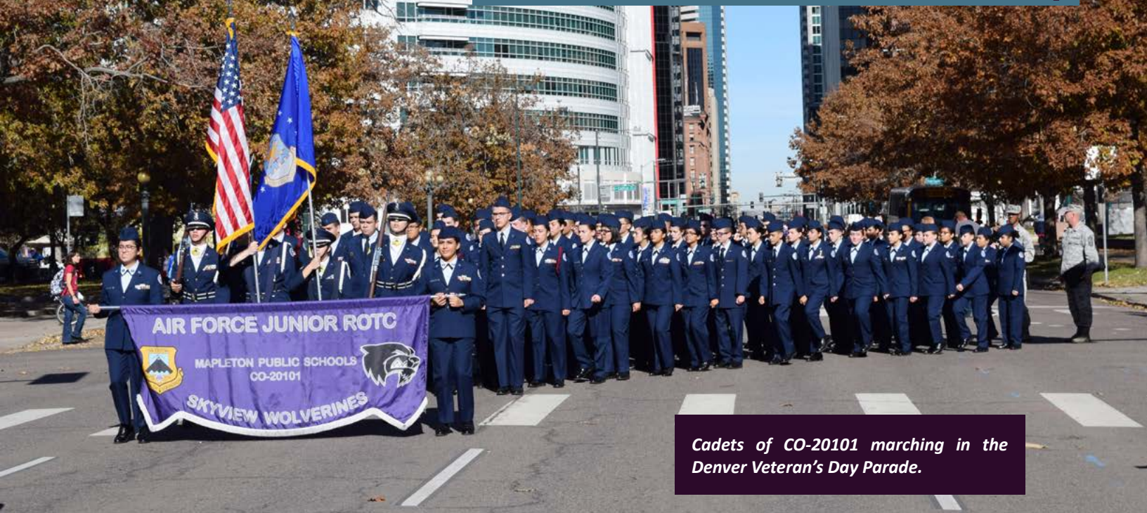
Cadets of CO-20101 marching in the Denver Veteran's Day Parade.