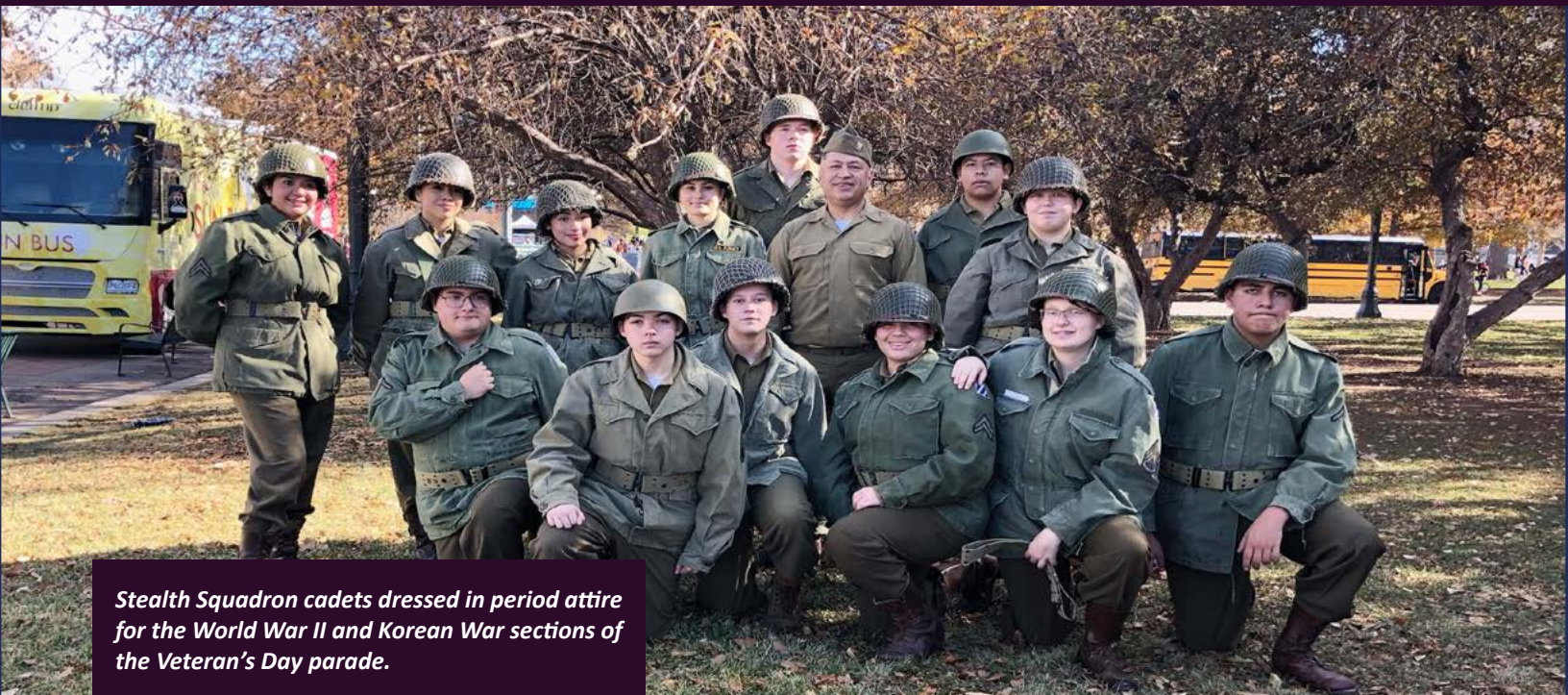
Stealth Squadron cadets dressed in period attire for the World War II and Korean War sections of the Veteran's Day parade.

In addition to marching in the parade, 13 Stealth Squadron cadets dressed in period attire from World War II and the Korean War and marched with personnel in that section of the parade. The vintage uniforms were donated by The Audie L. Murphy Infantry Museum. The mission of the museum is to educate the general public about America's military veterans from WWII and into the 21st Century. The cadets loved wearing the uniforms and getting a ride in a vintage jeep. The Stealth squadron cadets looked great that day!