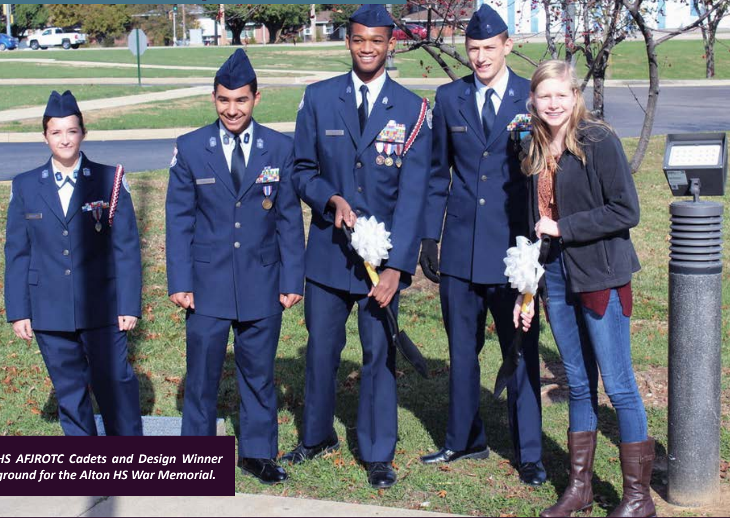
Alton HS AFJROTC Cadets and Design Winner break ground for the Alton HS War Memorial.